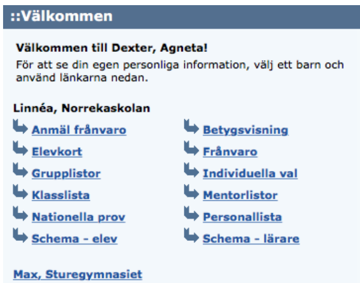
Picture 1. The desk with the shortcuts to the administrative section.