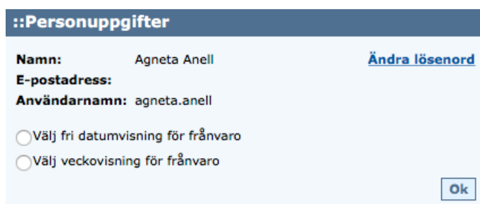
Picture 5. Change password and set free date display for absence.

At the same time, take the opportunity to set a free date display for absence. This means that you can later choose to look at previous absence(s), over a date range that you personally decide instead of fixed weeks.